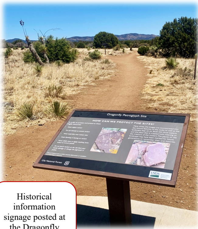
Historical information signage posted at the Dragonfly Trailhead